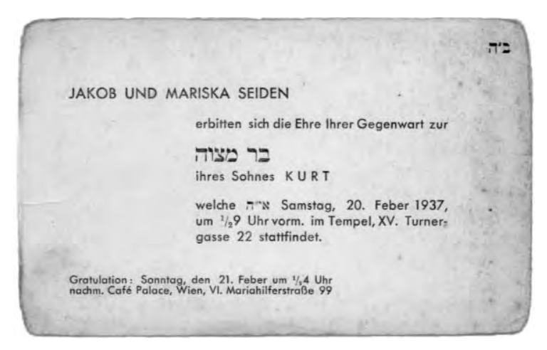
Invitation to Kurt's barmitzvah, 1937.